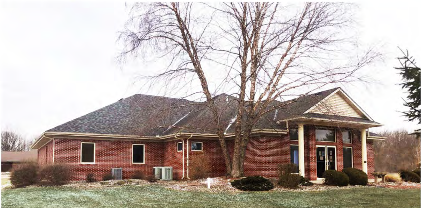
NIMA - Lagrange, IN