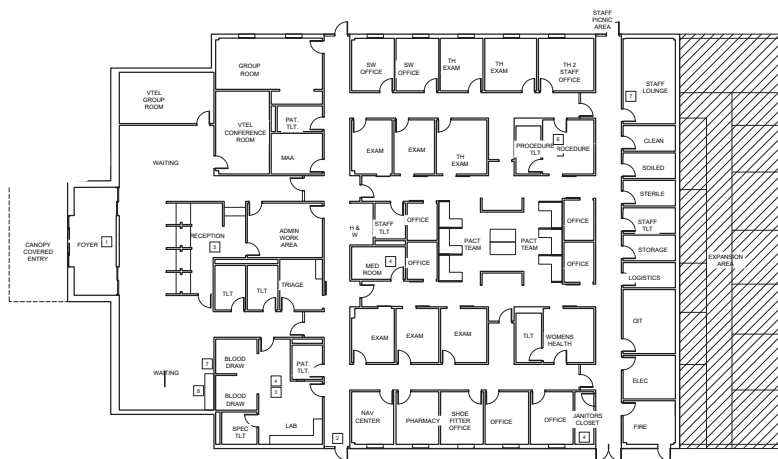
One Story Building